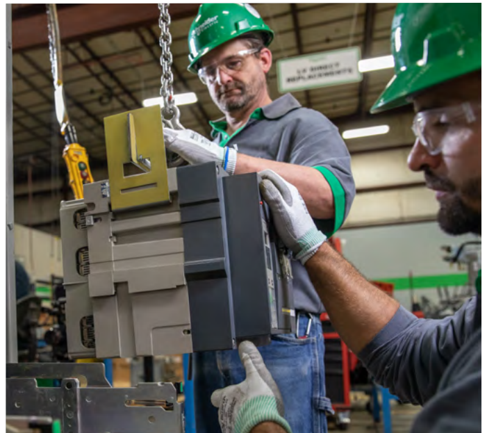
Equipment is de-energized

Both the direct replacement and retrofill solutions feature new cubicle doors to match the existing equipment and new circuit breaker face.