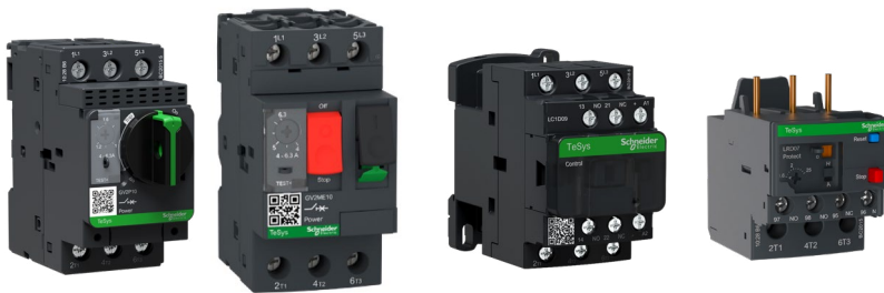
TeSys Power Deca Motor Circuit Breakers