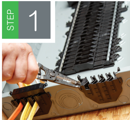
Remove the needed Qwiklet tabs