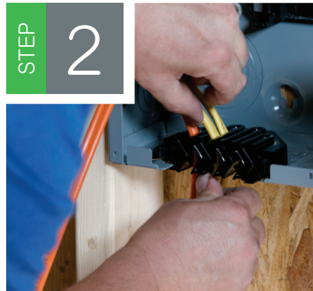
Slide the wire into the slot