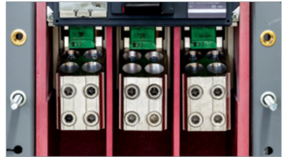
Temperature sensors can be read remotely without exposure to the line side conductors

Using Zigbee communication protocols, you can monitor main breaker operating temperatures on your wireless device. Schneider Electric's goal is to move away from reliance on PPE and administrative controls to more effective engineering controls and technology solutions.