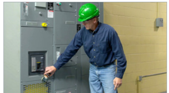
Reading the NFC (Near Field Communication Tag) on the equipment provides access to the mobile app while wearing minimal PPE