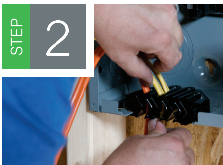
Slide the wire into the slot