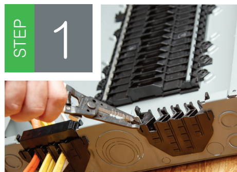
Remove the needed Qwiklet tabs